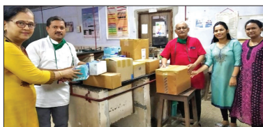
Donating goods to "Nana Palkar Smruti Samiti" at Lower Parel to help cancer patients