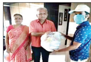
Door-to-Door Collection of Donations by Students