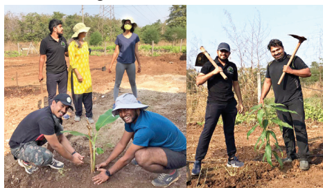
Political Science Association extension Activity of Ex-students planting saplings