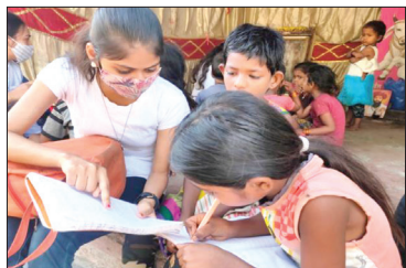
Education of Underprivileged Children an initiative taken by CEP Students