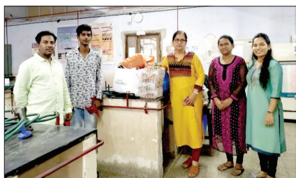
Donating supplies to 'Aadhar Adivashi Seva Ashram' (Kalyan).