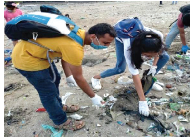
Beach Cleanup organised by the NSS unit