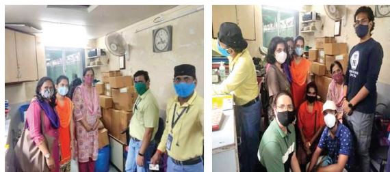
The Microbiology Department donating supplies to the needy patients and their relatives at TATA Cancer Hospital