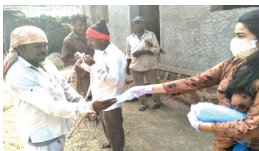
Mask distribution in Thakurwadi village (NSS unit)